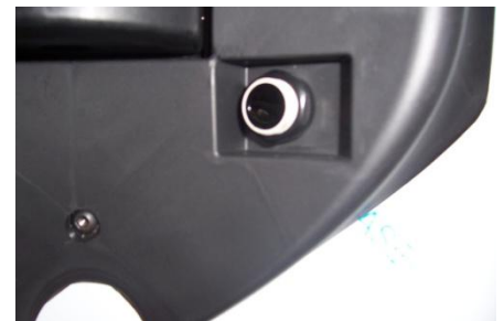
Photocell Eureka Fotocellula Eureka

NOTE FOR CLEANING, DON'T USE ANY KIND OF SOLVENT