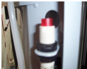
Photocell Archimede Fotocellula Archimede